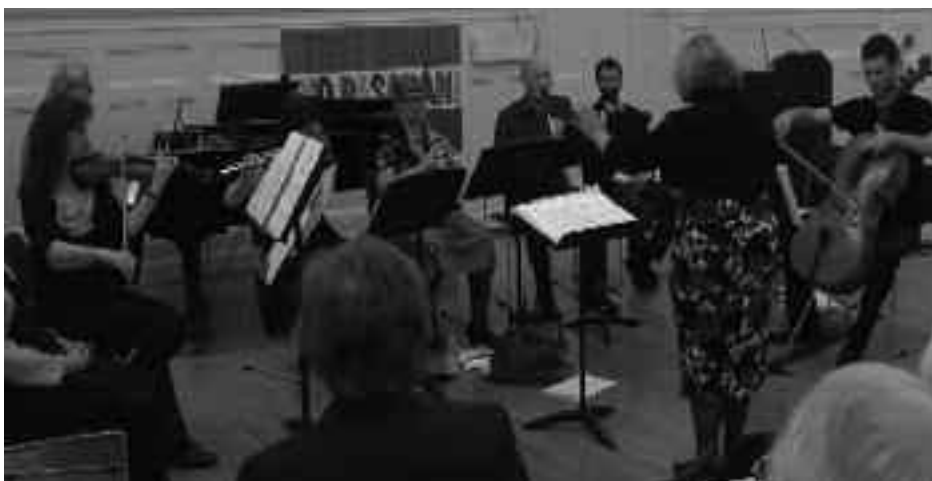
DE MADRUGADA ENSEMBLE: Playing new compositions at the concert in London.