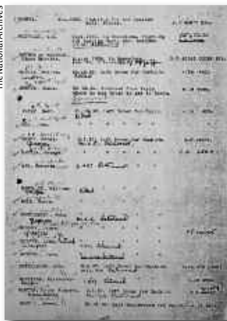
SECRET: Extract from MI5's list of 4,000 “volunteers”.

little the security services could actually do about it, despite the government's attempt to invoke the obscure Foreign Enlistment Act.