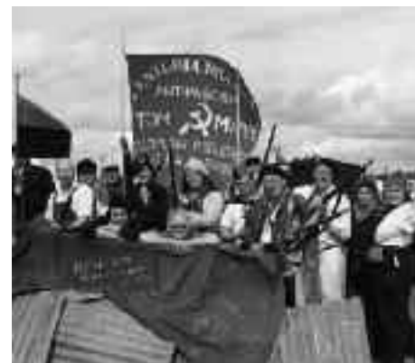
WHERE'S THE ENEMY? To mark the 75th anniversary of the start of the Spanish Civil War, members of the La Columna Spanish Civil War re-enactment group staged a depiction of the arrival of volunteers in Barcelona at the English Heritage Festival of History at Kelmarsh Hall, Northamptonshire on 16/17 July.